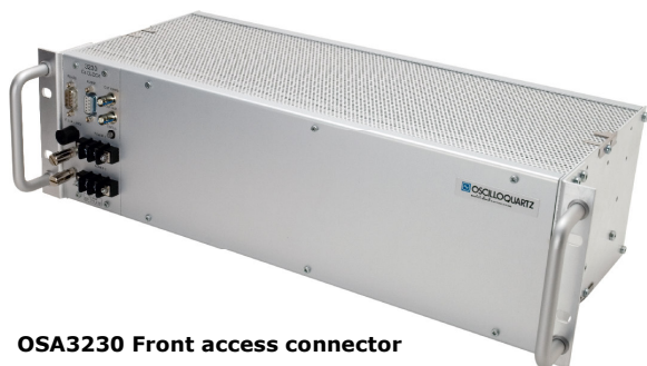
OSA3230 Front access connector